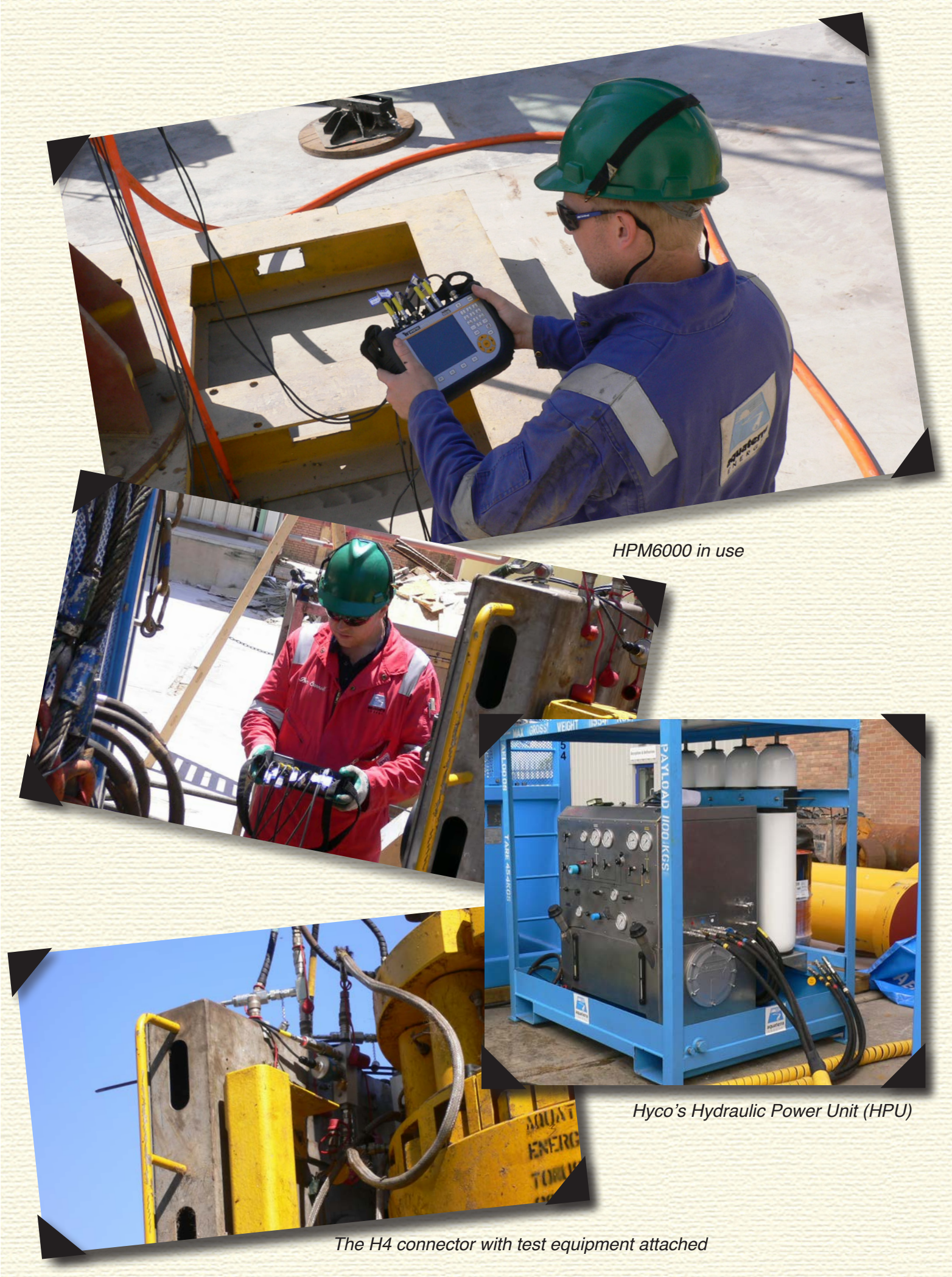
HPM6000 in use

The HPM6000 turned out to be as simple to operate as the average mobile phone, the graph readouts were clear and simple to understand, the battery only needed to be recharged once in three days of testing and, despite the fact that the work was conducted in bright sunlight, the equipment screen was clearly visible.