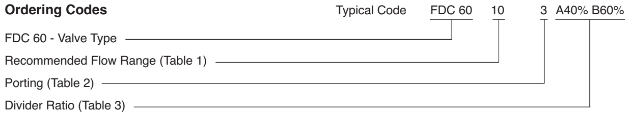
Table 1: Recommended Flow Range