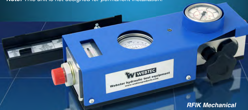
RFIK Mechanical Hydraulic Tester

Note: This unit is not designed for permanent installation.